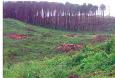
Clearfelled patch – unplanted

In a recent interview with the Planning Officer for Viphya Plantations, Mr Nyondo, it was learnt that because of the lack of viable alternatives for plantation wood, in the form of pulp to supply a paper mill, the wood is now being sold for timber and firewood production at the rate of 500 hectares per year. The “waste” wood, whips, dead and dying trees are scavenged by local firewood vendors and ferried on trucks or bicycles in billet form to the urban centres.