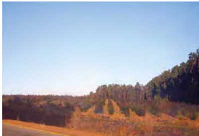
Clearfelled and planted patch