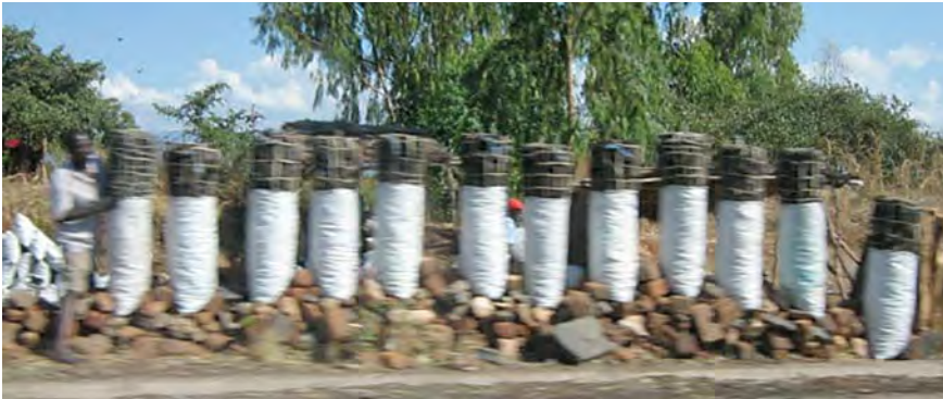
Roadside sales of charcoal

Charcoal production is a common and disturbing feature on customary land forests where unregulated production of charcoal is taking place on an unprecedented scale. While it is accepted that charcoal is a convenient form of energy for domestic use, when it is being produced from forest areas that cannot sustain the current production levels it creates a problem. The ultimate result includes degraded forest resources and a damaged environment. Alternative renewable sources are being explored but it is doubtful that they can replace charcoal, as the technologies are not affordable by the majority of users.