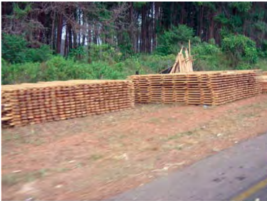
Air-seasoning of timber by the roadside

Except in the 20 000 hectares under concession agreement between the government Department of Forestry and Raiply, clear-cut areas are not being planted at