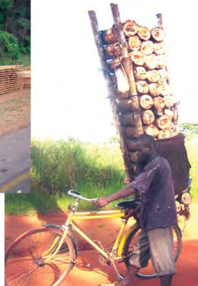
Mzuzu firewood vendor